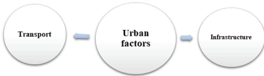
Figure 2. Deterministic influence of urban factors on educational attainment and pupils' achievements

Source: Author's own. Data from the U.S. National Center for Education Statistics (NCES)